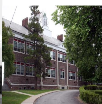
Central High School