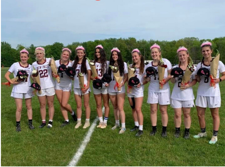
Varsity Girls Lacrosse Senior Rec 5/18