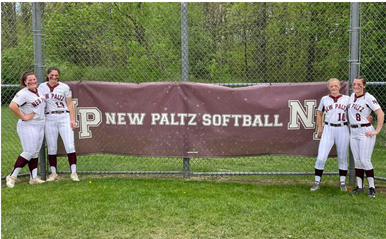
Varsity Softball Senior Rec last Friday 5/13